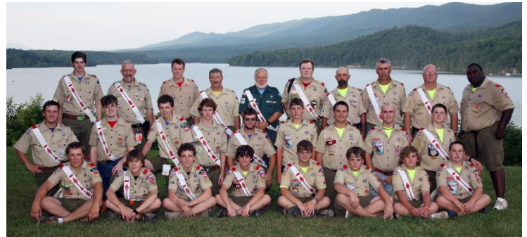
George Washington and Jefferson National Forest Roanoke, Virginia June 21-28, 2008

Tsoiotsi Tsogalii Lodge issued three, two-piece sets for ArrowCorps5. There were 1,000 black border sets, 400 red border sets, and 100 silver mylar border sets. The silver mylar sets along with 100 black and red border set were sold for $50.00 for the six patch set. The red border patches were sold for $5.00 per set to delegates only. The black border sets were available to everyone at $5.00 a set.