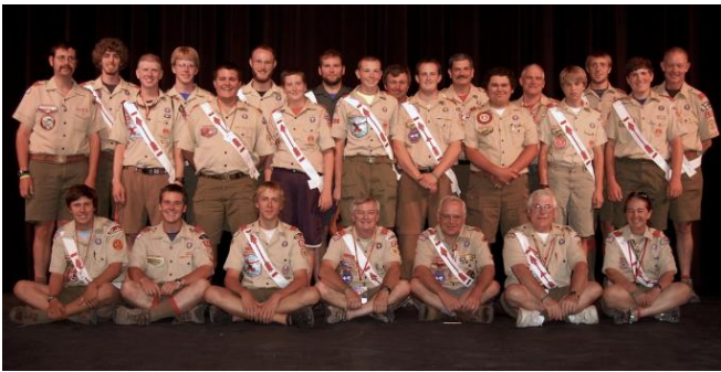
Bridger-Teton National Forest Jackson, Wyoming July 26 to August 2, 2008