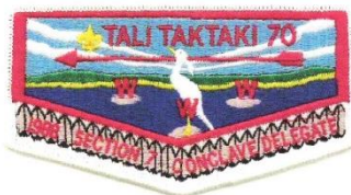
S13 – 1988 SE-7 Conclave