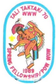
1989 Fall Fellowship