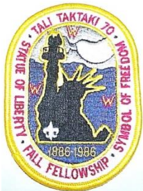
1986 Fall Fellowship