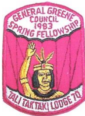
1983 Spring Fellowship