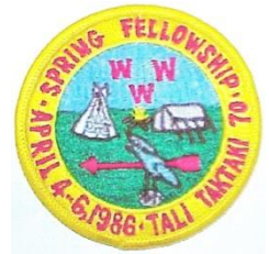
1986 Spring Fellowship