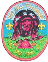
1983 Fall Fellowship