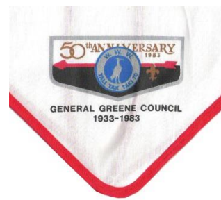
N4 – 50 th Anniversary