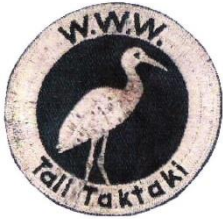
R1 – “Duck Patch”