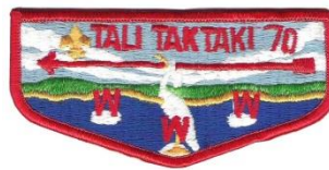
S6 – Yellow fdl