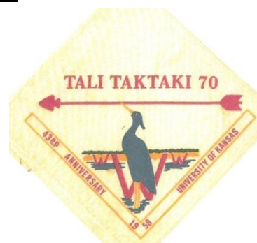
N1 – 1958 NOAC