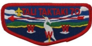
S8 – VER clouds on left