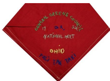
N0.5 – 1952 NOAC