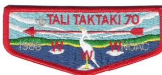
S14 – 1988 NOAC