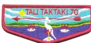
S10 – Lt. Blue Sky - YEL fdl