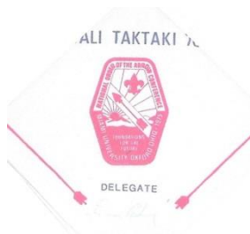
N2 – 1975 NOAC