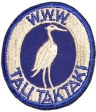
X2 – Oval - TAKTAKI