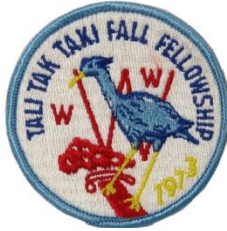
1973 Fall Fellowship