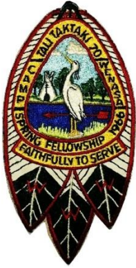
1966 Spring Fellowship