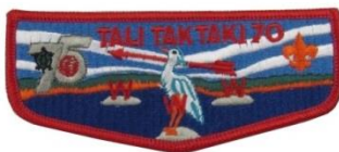
S17 – OA 75 th