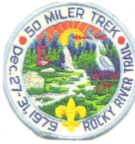
1979 50 Miler