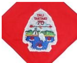
A1 – On red neckerchief