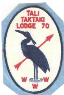
X5 – Hairs on Heron's Chest