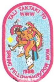
1988 Spring Fellowship