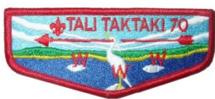
S12 – Arrow in Heron head