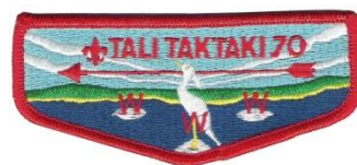
S15 – Arrow behind head