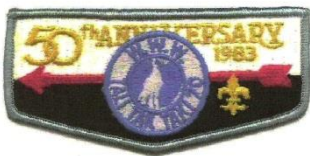
S4 – 50 th Anniversary – Horz