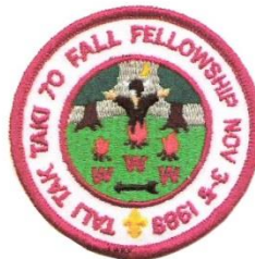
1989 Spring Fellowship