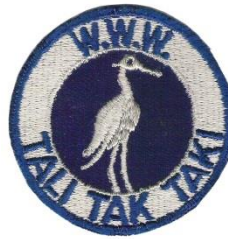
R3 – Twill Round