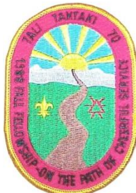
1988 Fall Fellowship