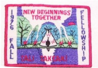
1976 Fall Fellowship