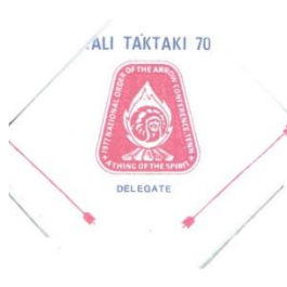
N3 – 1977 NOAC