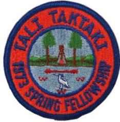
1973 Spring Fellowship