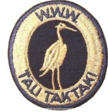
X1 – “Sunburst” Oval