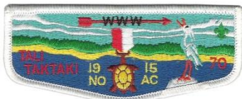
S16 – 1990 NOAC