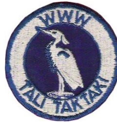
R4a – GRY Heron facing left