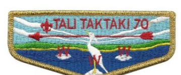
S11 – Gold mylar bdr