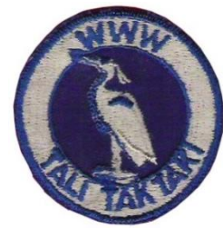
R4b – DGY Heron facing left