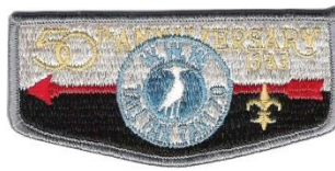
S5 – 50 th Anniversary – Vert