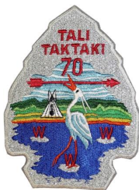
J1 – Jacket Patch