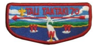
S7 – Rounded corners