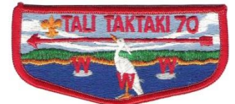
S3 – Light Orange fdl