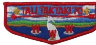
S2 – Gold mylar fdl