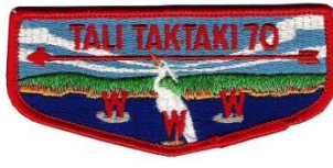
S1b – Blue Sky