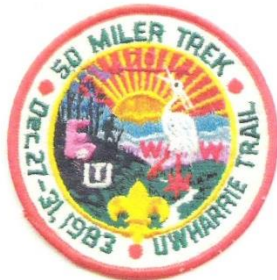
1983 50 Miler