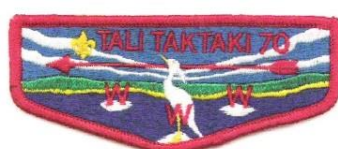
S9 – Dark Blue Sky – YEL fdl