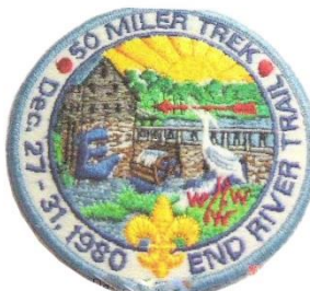
1980 50 Miler