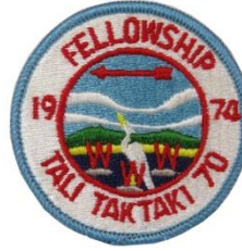
1974 Spring Fellowship