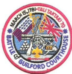
R5 – Historic Trail Patch