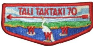
S1a – Light Blue Sky (1957)