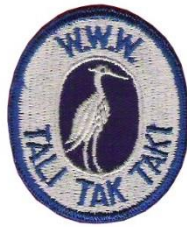
X3 – Oval – TAK TAKI