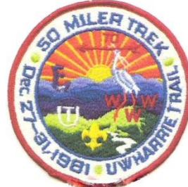
1981 50 Miler