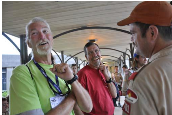
Trader Patch Set