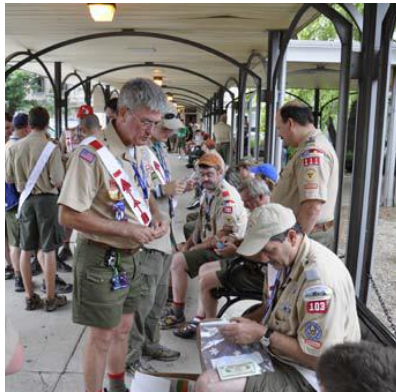
Tsoiotsi Tsogalii Lodge 70 2009 NOAC Delegation